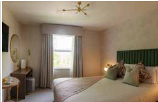
CLASSIC SPA BEDROOM